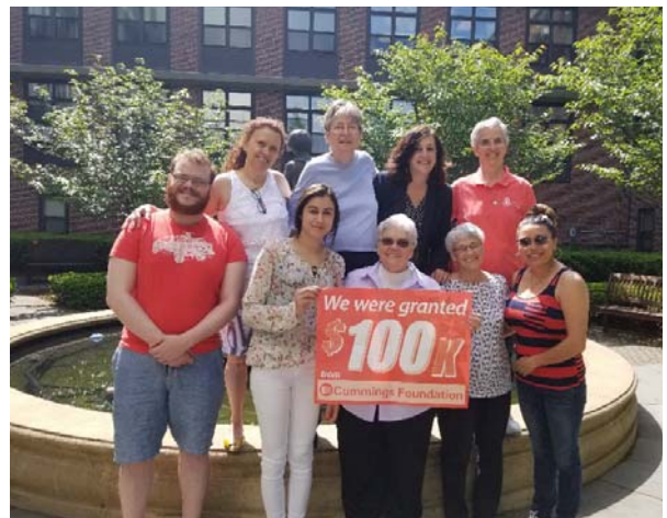
Thank you with all of our heart! -The Literacy Connection

This year’s diverse group of grant recipients represents a wide variety of causes, including homelessness prevention and affordable housing, education, violence prevention, and food insecurity. Most of the grants will