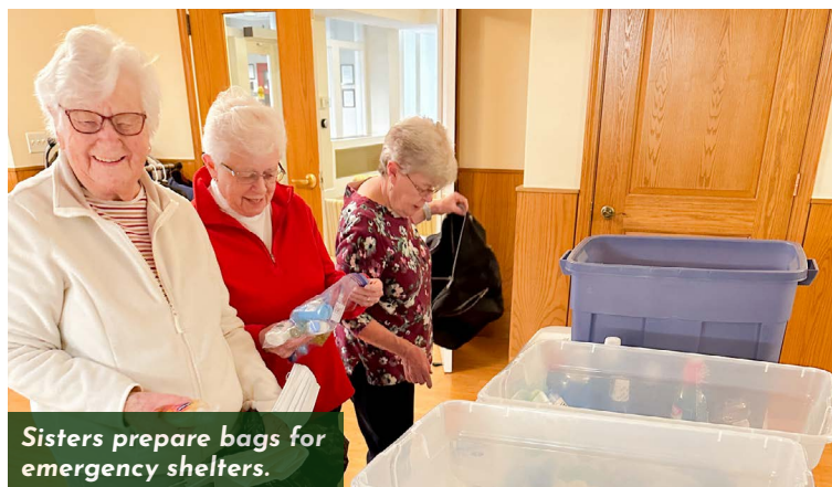
Sisters prepare bags for emergency shelters.

United Nations Convention On Climate Change – or the COP, is a meeting of world leaders, scientific experts, climate activists, and lobbyists to discuss transnational policies to address the climate crisis. United Arab Emirates will host the 28th Conference of the Parties, from November 30th to December 13th. Visit our Instagram to learn more. Not on social media? Click here!